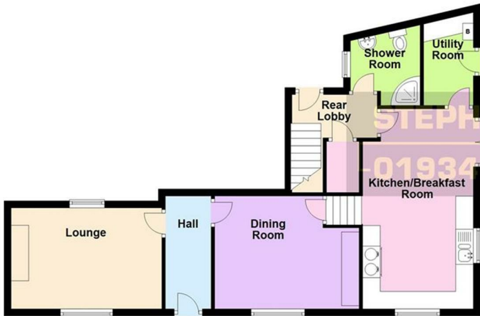
Ground Floor Approx. 62.5 sq. metres (672.7 sq. feet)